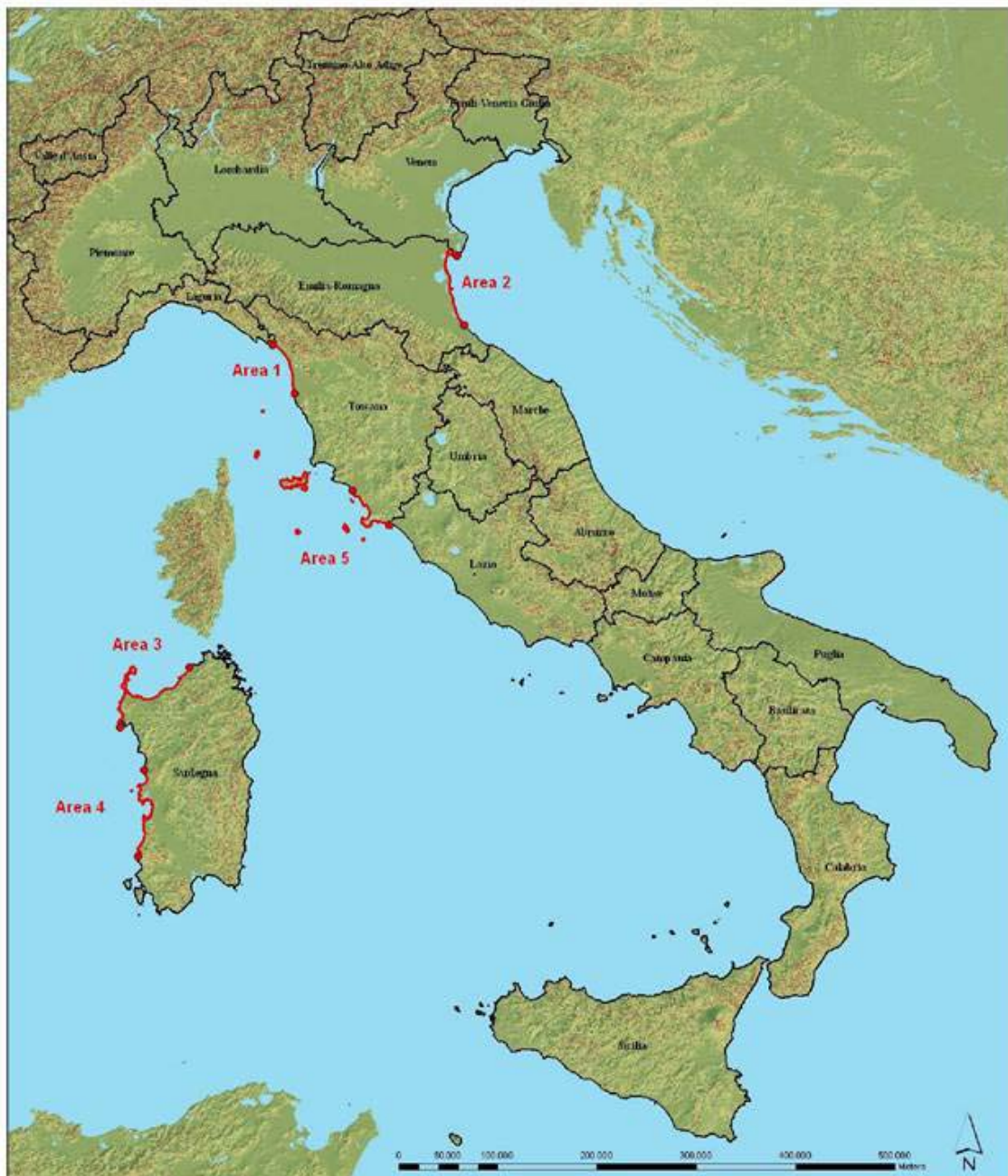
Figure 1. CAMP Italy Project Areas